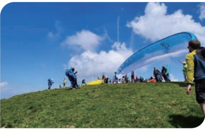
Won Chi-gwon's local adaptation practice flight during the 2021 Swiss Paragliding Superfinal