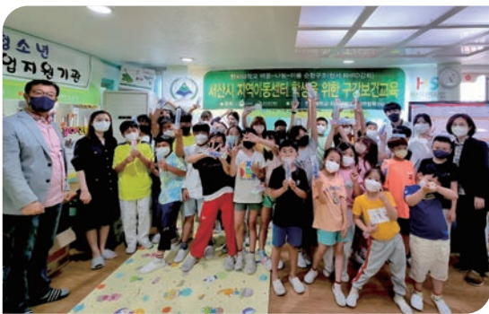
Dental Hygiene Student Supporters conducting oral health education at the local children's center