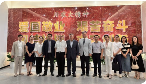
The visiting delegation from Hanseo taking a commemorative photo at Sichuan Agricultural University.