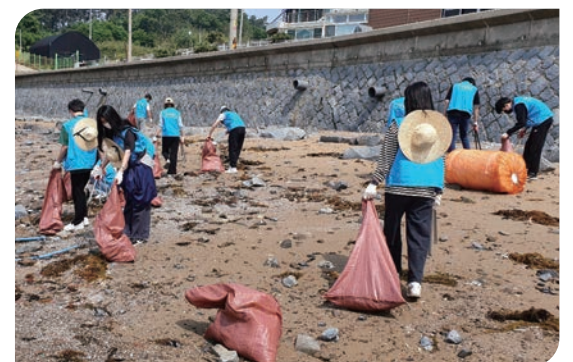
Student Supporters' Taean Beach Cleanup Campaign on Ocean Day (May 29, 2022)