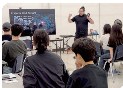
Special Lecture delivered by Silicon Beach Startup "WEVER" expert

During the program, the students gained insights into global entrepreneurship trends and developed their own entrepreneurial skills by benchmarking various business models through training by local experts. The main focus of the entrepreneurship training was to prepare marketing strategies for their startup ideas to enter the global market. The program included workshops that emphasized team-based planning using design thinking and brainstorming techniques, market research, and persona marketing. Toward the end, the students conducted consumer interviews