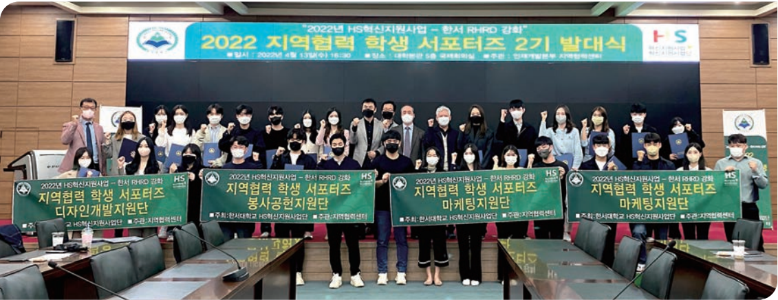
Inauguration ceremony of the 2nd cohort of Regional Cooperation Student Supporters (April 13, 2022)

Our university's Regional Cooperation Center has been collaborating with local governments and community organizations to pursue various projects regularly each year. Let me introduce some of the important projects: The center supported the Taeon County Chrysanthemum Festival. Last fall, 65 volunteer participants engaged in preparing chrysanthemum cultivation and providing loading and unloading services for the festival. In May of this year, 25 participants volunteered for the Children’s Day event in Taeon County, taking charge of the entire event. In 2022, the center’s head and a student