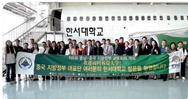
Thirty-five Chinese officials from 9 provincial governments who visited Hanseo University's Taeon Campus

During the “6th South Chungcheong Province-China Provincial Government Exchange Meeting,” in which our university and nine local governments of China participated, discussions were held on cooperation in the field of higher education and ways to invigorate group tourism. The meeting took place from July 26 to July 27 at Lotte Resort Buyeo, and 35 officials from educational authorities and universities from nine regions in China, including Hebei, Heilongjiang, Jilin, Yunnan, Sichuan,