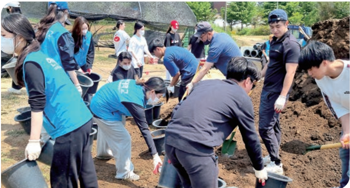
Student Supporters' volunteer service at the Taeon County Chrysanthemum Festival in Fall 2022