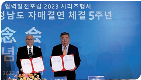
The presidents of Hanseo University and Sichuan Agricultural University are exchanging an agreement.