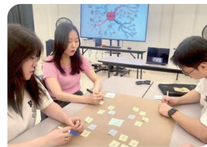
Meetings held to establish marketing strategies through brainstorming

The primary goal of the program, initiated by our university’s LINC3.0 group, is to expand the students’ startup ecosystem to a global level. Every year, the LINC3.0 group actively supports students who possess excellent technology and intend to expand overseas. The “2023 Global Entrepreneurship Enhancement Program” serves as a prime example of this support. The LINC3.0 group also