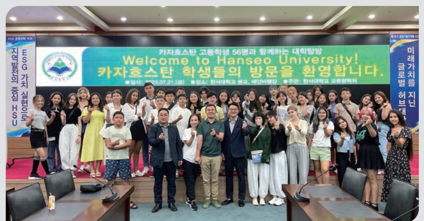
Commemorative photo of Kazakh students visiting Hanseo University

In the afternoon, campus tours were conducted at our main campus and the Taeon Airfield Campus. The students carefully examined our university's educational facilities and infrastructure, and showed particular interest in the educational programs and facilities