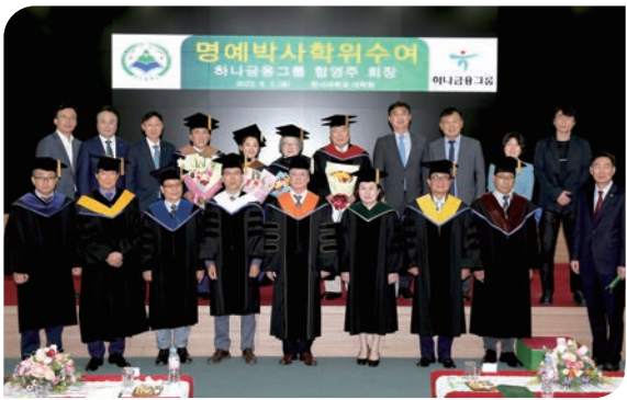
Commemorative photo of participants at the honorary doctoral degree conferment ceremony (International Conference Hall).