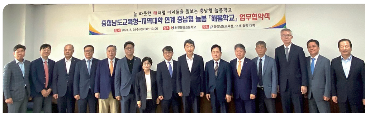
Commemorative photo with the 11 university presidents participating in the agreement