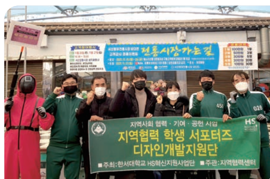
Student Supporters from Hanseo University assisting in the design of traditional market revitalization event (November 2021)

We believe that our university’s “Regional Cooperation Student Supporters” are spreading a positive image of our university in the local community while engaging in various activities to address local issues. Our center has been operating the Student Supporters’ program since 2021, and it is currently in its fourth semester. The Student Supporters are divided into five teams: Volunteer Contribution Support Teams 1 and 2, Marketing Support Teams 1 and 2, and Design Support Team 1. They plan and execute diverse activities while communicating with various institutions and organizations in the local community. This is an activity where students independently identify and solve local issues. Through collaboration and communication with local governments and social organizations, they work together to solve problems and enhance students’ academic capabilities, making it an immensely educational program. The Regional