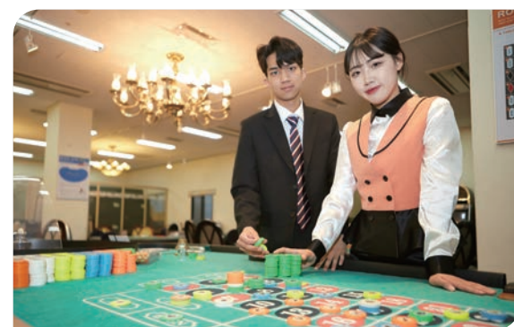
Hanseo University students participating in practical lab classes