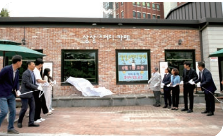
Imagination Study Café opening ceremony

A new student welfare space “Imagination Study Café” has been opened in the building on the right side of Ingok Hall. The opening ceremony, hosted by the HS Innovation Project Group on June 1, was attended by about 30 people, including President Ham and key officials. The café, run without any human staff, is divided into an open space where students can study while enjoying more than 60 varieties of coffee and tea, and a closed space that accommodates group study in a café-like environment. The closed space also provides a space for using computers and laptops freely, as well as an area where videos of TED (Technology, Entertainment, Design) Talks, run by an American non-profit organization, are available in English, covering a wide range of topics from the latest scientific discoveries to international issues. The café opens from 9:30 am to 6 pm, but the opening hours may be adjusted based on the usage patterns of its users.