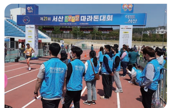
Student Supporters' volunteer service at Seosan Tteumbugi Marathon Competition (April 17, 2022)