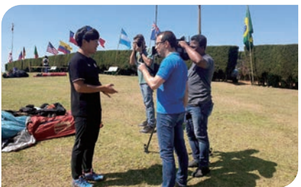
Won being interviewed by local media during the Brazilian Paragliding World Cup (2019)