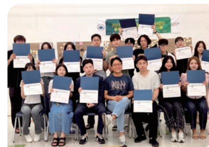
Completion ceremony of the Global Entrepreneurship Program

plans to provide additional funding for prototype development, marketing support, and other expenses to facilitate the actual commercialization of the outstanding startup ideas recognized in this program.