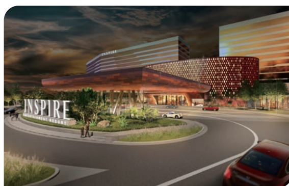
INSPIRE Entertainment Resort concept drawing

States. It is preparing for its opening in the second half of 2023 and will feature facilities such as a foreigner-only casino, a five-star hotel with over 1,200 guestrooms, a 15,000-seat arena for multi-purpose performances, a retail space combining convention centers and entertainment, an indoor water park available throughout the year, and an outdoor themed attraction area.